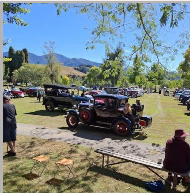
Kids getting rides in the dickie seat.