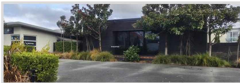
Archive building next to main office on Meadow Street