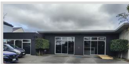
New head office on Meadow Street