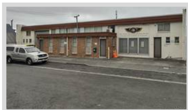
Old NZVCC building in Aberdeen Street

Murray Trounson reported on the sale of the old club head office and the purchase of new buildings. The old building was affected by the Christchurch earthquakes, so NZVCC had already received an insurance payout of around $300,000. The RV on the old building was about $310,000, but it ended up selling for $710,000 at auction (purchased by a near neighbour). The new buildings cost $1.25 million, with a few more costs to come to complete the fit out.