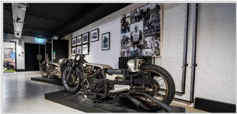
Replica bike on display at Classic Motorcycle Mecca

Noel showed plenty of photos and shared lots of stories from the making of the bikes and the movie, from the early days of testing the bikes, to running them flat out on the Bonneville salt flats.